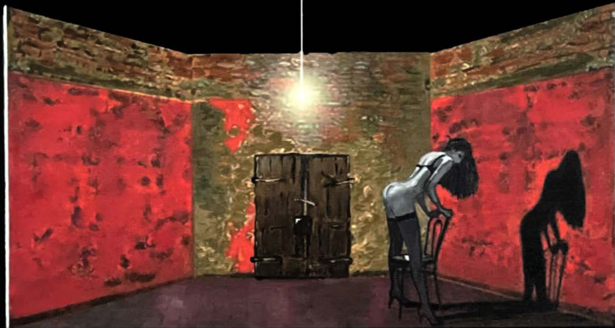
THE LIGHT installation art by Spina.Police