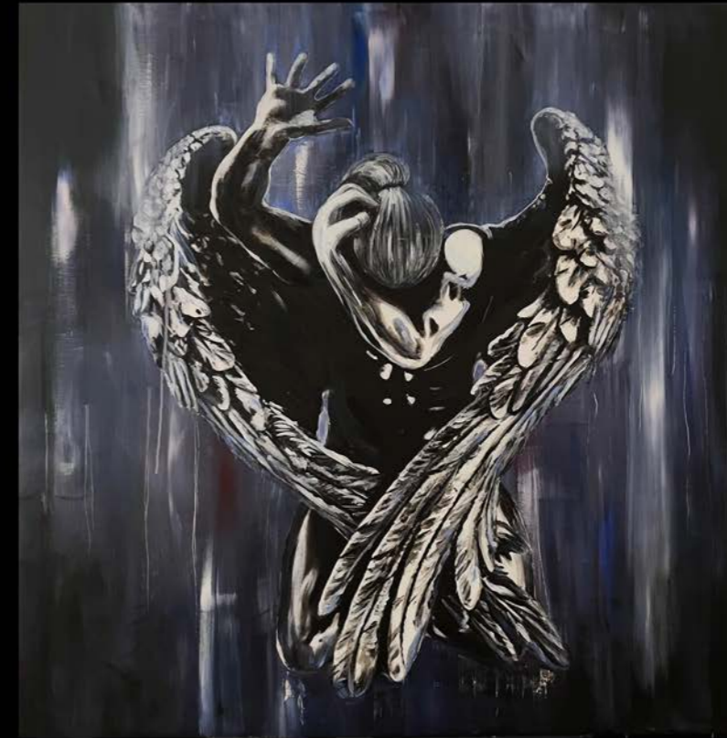
THE FALLEN ANGEL installation art by Spina.Police

You can admire the painting together with its soundtrack, the song “Status quo”, from the “Rose Park” album by Spina.Police, through QR CODE. . Two art languages, the painting and the music form a unique story that accompanies us to the fantasy world of the protagonist of the painting. Acrylic painting on canvas 188x85. Installation art soundtrack “A cruel game for harmony” song from the album “Umbra” by Spina.Police.