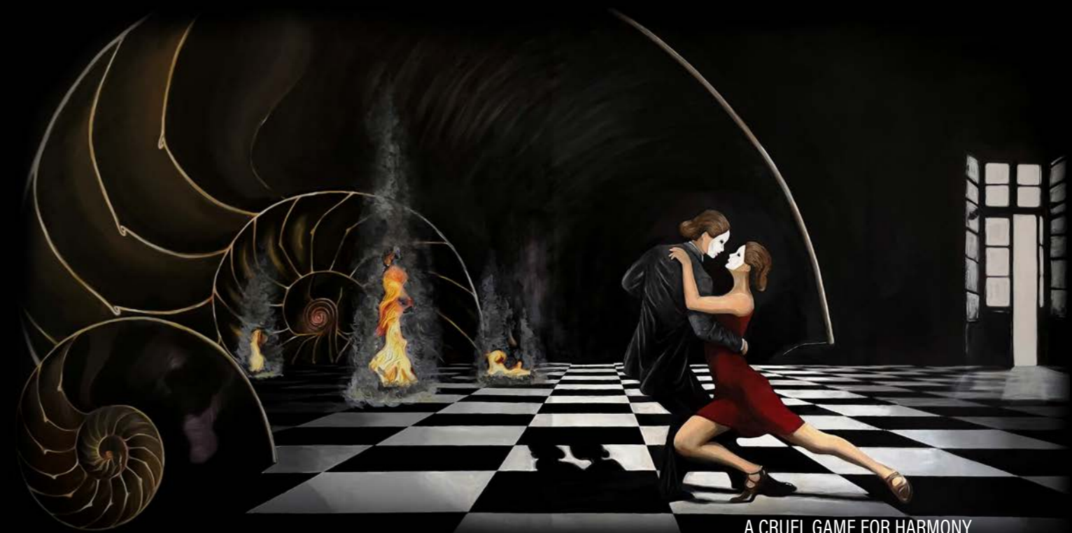
A CRUEL GAME FOR HARMONY installation art by Spina.Police

Acrylic painting on canvas 100x100 Installation art soundtrack "The Forest of Kaya" song from the album "Umbra" by Spina.Police