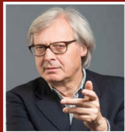
Vittorio Sgarbi Art critic