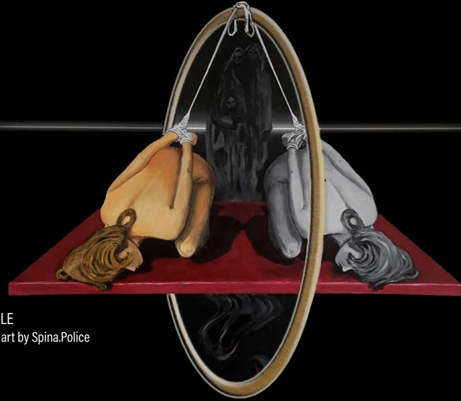
THE DOUBLE installation art by Spina.Police